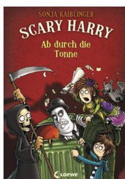
Scary Harry – Down the Can (Vol. 4)