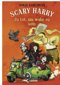
Scary Harry – Too Dead to be True (Vol. 8)