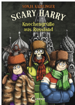
Scary Harry – Bony Greetings from Russia (Vol. 7)