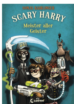
Scary Harry – Master of All Ghosts (Vol. 3)