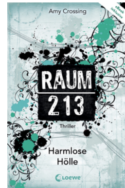
Room 213 – Harmless Hell