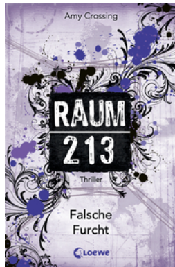
Room 213 – False Fear