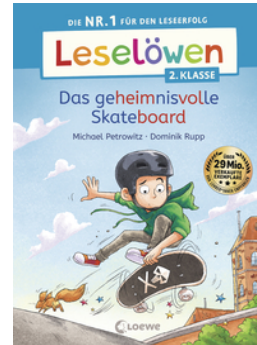
Reading Lions (Year 2) – The Mysterious Skateboard