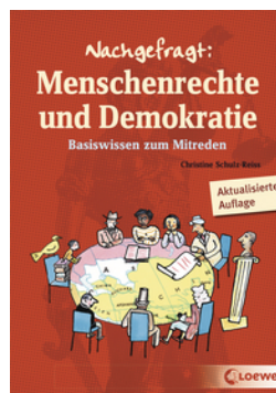
Guide to Human Rights and Democracy