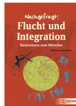
Guide to Refugee Migration and Integration