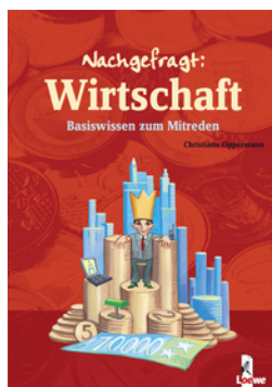
Guide to Economics