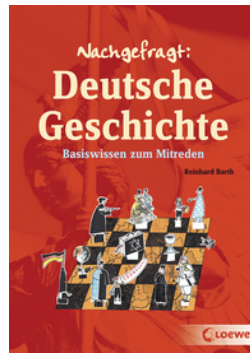
Guide to German History