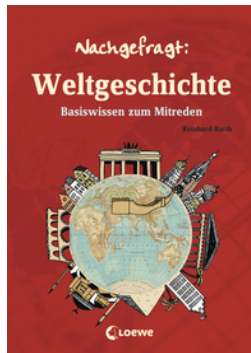
Guide to World History