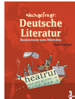
Guide to German Literature