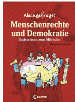
Guide to Human Rights and Democracy