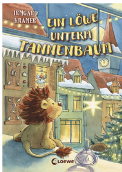
A Lion under the Christmas Tree