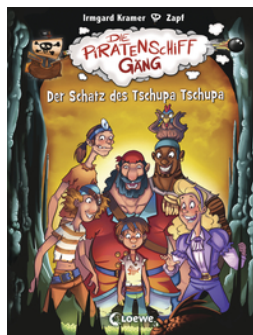
The Pirate Ship Gang - The Treasure of the Chupa Chupa (Vol. 4)