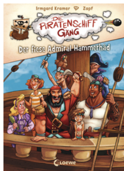
The Pirate Ship Gang – The Abominable Admiral Hammerhead (Vol. 1)