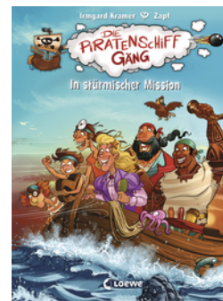
The Pirate Ship Gang – On a Stormy Mission (Vol. 3)