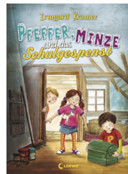
Pepper, Mint and the School Ghost (Vol. 2)