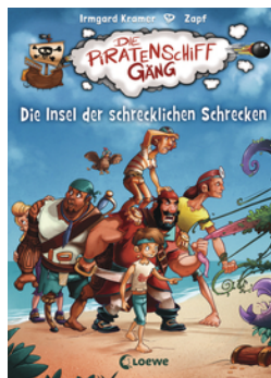
The Pirate Ship Gang – The Island of Horrible Horrors (Vol. 2)