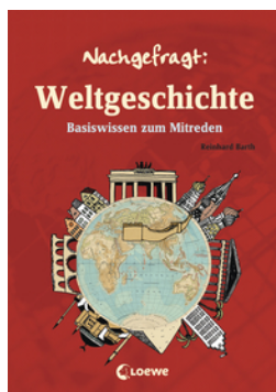
Guide to World History