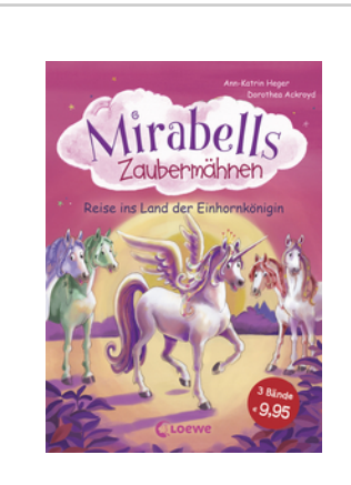
Mirabelle's Magical Manes -Come Into the Land of the Unicorn Queen! (Vol. 1-3)