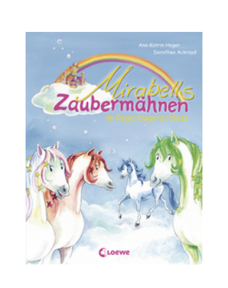
Mirabelle's Magical Manes in the Rainbow Castle (Vol. 1)