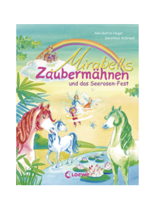
Mirabelle's Magical Manes and the Water Lily Festival (Vol. 3)