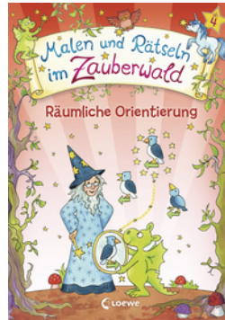
Drawing and Quiz-Solving in the Enchanted Forest - Spatial Orientation