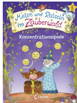
Drawing and Quiz-Solving in the Enchanted Forest - Concentration