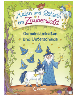
Drawing and Puzzle-solving in the Enchanted Forest - Similarities and Differences