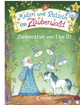
Drawing and Puzzle-solving in the Enchanted Forest - Number Puzzles from 1 to 10