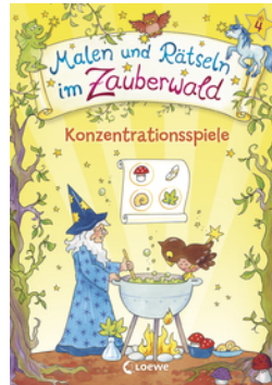
Drawing and Puzzle-solving in the Enchanted Forest - Concentration Games