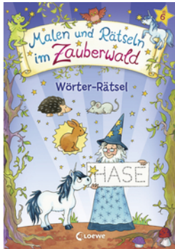
Drawing and Quiz-Solving in the Enchanted Forest - Word Riddle