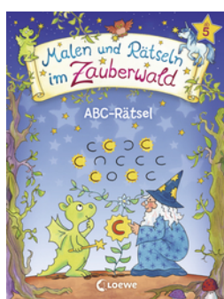
Drawing and Puzzle-solving in the Enchanted Forest - ABC-Quiz