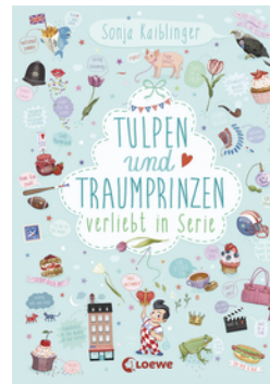
Love in Series | Episode 3 – Tulips and Prince Charmings (Vol. 3)