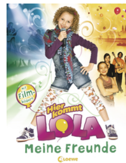
Here Comes Lola! My Best Friends