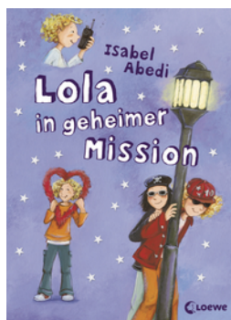
Lola's Secret Mission (Vol. 3)