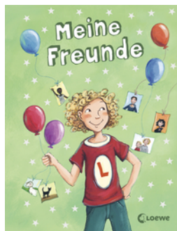
My Best Friends