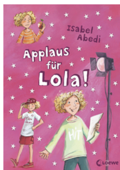
Applause for Lola! (Vol. 4)