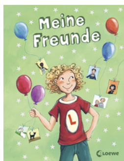
My Best Friends