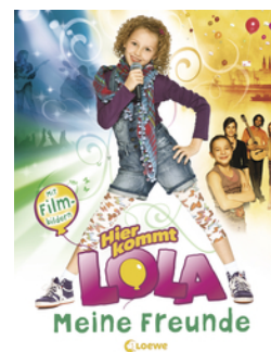
Here Comes Lola! My Best Friends