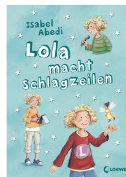
Lola Makes Headline News (Vol. 2)