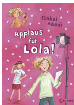
Applause for Lola! (Vol. 4)