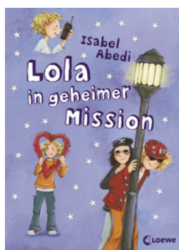
Lola's Secret Mission (Vol. 3)