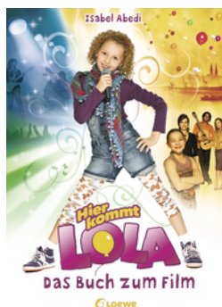
Here Comes Lola! (Movie Book)