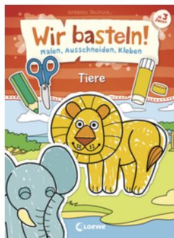
Let's Do Arts & Crafts! 5+ - Painting, Cutting out, Gluing Animals