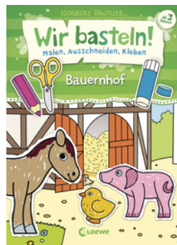
Let's Do Arts & Crafts! 5+ - Painting, Cutting out, Gluing Farm