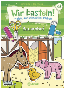
Let's Do Arts and Crafts! - Farm