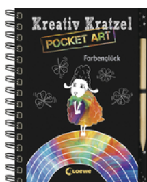
Creative Scratch Pocket Art: A Rainbow of Colour