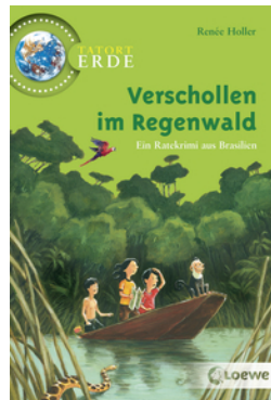
Global Mysteries – A Disappearance in the Rain Forest