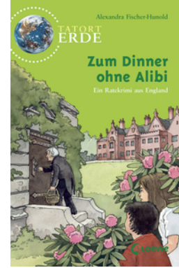
Global Mysteries – Dinner without an Alibi