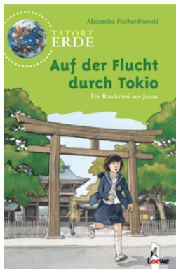
Global Mysteries – Chased through Tokyo