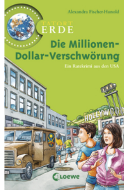
Global Mysteries – The Million Dollar Conspiracy