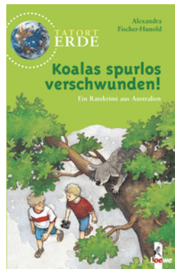
Global Mysteries – The Mystery of the Disappearing Koalas