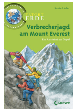
Global Mysteries – Hunting Criminals At the Foot of Mount Everest