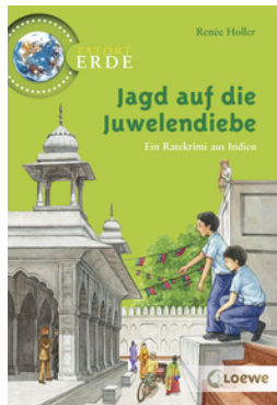
Global Mysteries – The Hunt for the Jewel Thieves