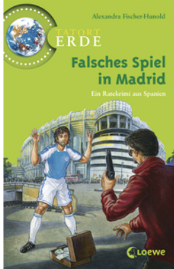
Global Mysteries – Foul Game in Madrid