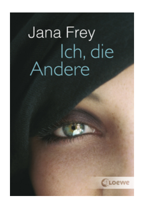
I Am the Other