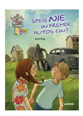
Reading Pirates Champion, Never Get Into a Stranger's Car!