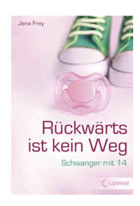
No Going Back