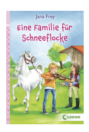
A Family for Snowflake