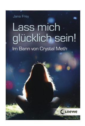
Let Me Be Happy! - In Thrall to Chrystal Meth