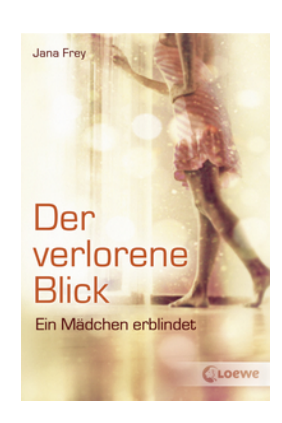
Lost in the Dark - A Girl Goes Blind