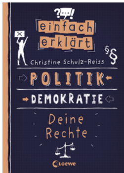
Simply Explained – Politics, Democracy, Your Rights