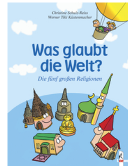
What Does The World Believe?