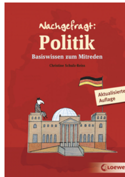
Guide to Politics