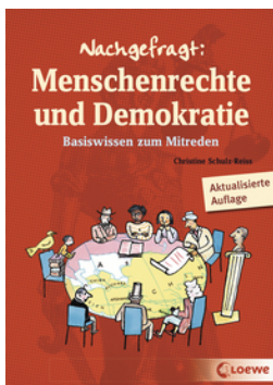
Guide to Human Rights and Democracy