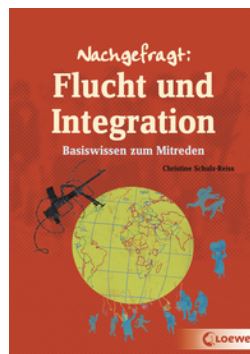
Guide to Refugee Migration and Integration