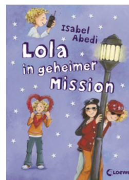
Lola's Secret Mission (Vol. 3)