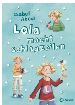
Lola Makes Headline News (Vol. 2)