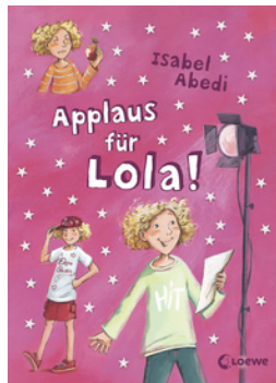
Applaus for Lola! (Vol. 4)