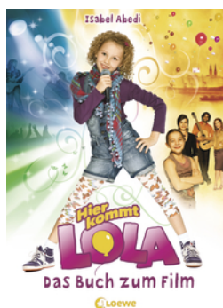
Here Comes Lola! (Movie Book)