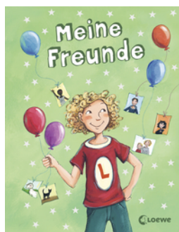
My Best Friends