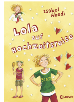
Lola on Honeymoon (Vol. 6)