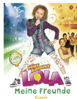
Here Comes Lola! My Best Friends