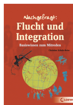
Guide to Refugee Migration and Integration