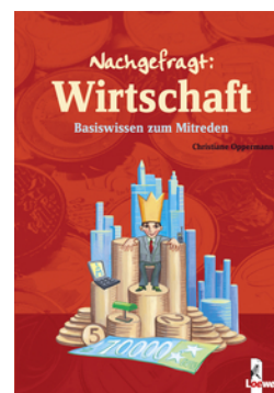
Guide to Economics