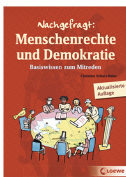
Guide to Human Rights and Democracy