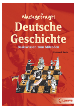
Guide to German History