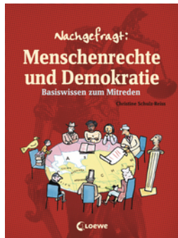
Guide to Human Rights and Democracy