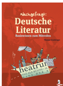
Guide to German Literature