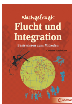
Guide to Refugee Migration and Integration