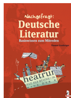
Guide to German Literature