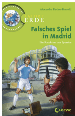
Global Mysteries – Foul Game in Madrid