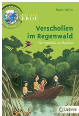
Global Mysteries – A Disappearance in the Rain Forest