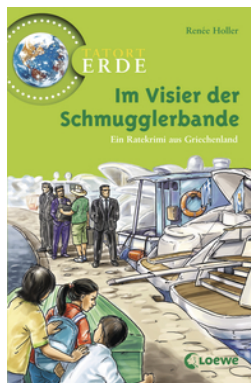
Global Mysteries – Caught By The Smugglers