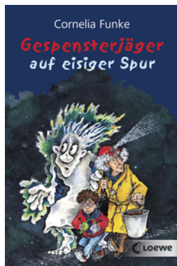
Ghosthunters on Icy Trails