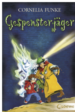
Ghosthunters (bind-up paperback)