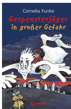
Ghosthunters and the Muddy Monster of Doom