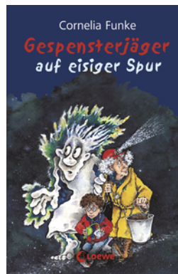
Ghost Hunters and the Incredibly Revolting Ghost