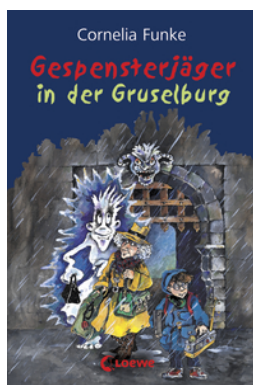
Ghosthunters and the Totally Moldy Baroness