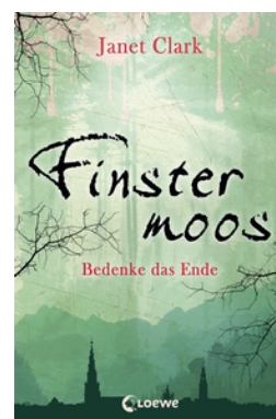
Finstermoos – Reflect Upon the End (Vol. 4)