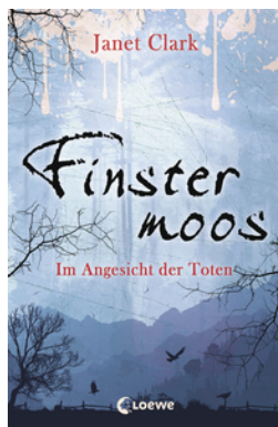
Finstermoss – At Death's Door (Vol. 3)