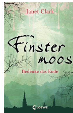
Finstermoss – Reflect Upon the End (Vol. 4)