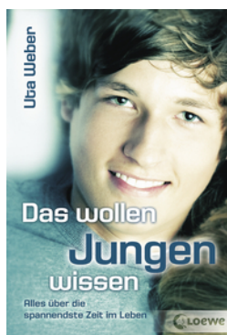
All Boys Want to Know – Facts about the Most Exciting Time of Life