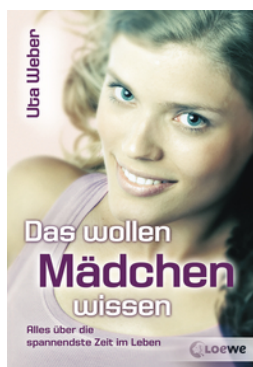
All Girls Want to Know – Facts about the Most Exciting Time of Life