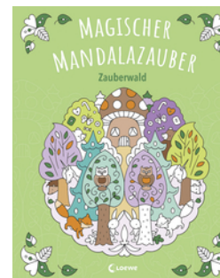
Enchanting Mandala Magic – Magical Forest