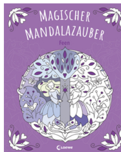
Enchanting Mandala Magic – Fairies