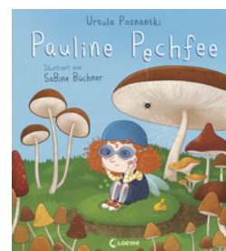
Pauline the Flop-Fairy