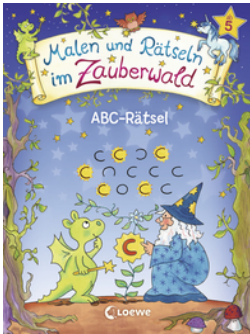
Drawing and Puzzle-solving in the Enchanted Forest - ABC-Quiz