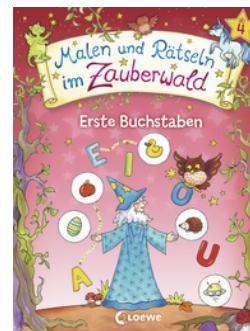
Drawing and Puzzle-solving in the Enchanted Forest - First Letters