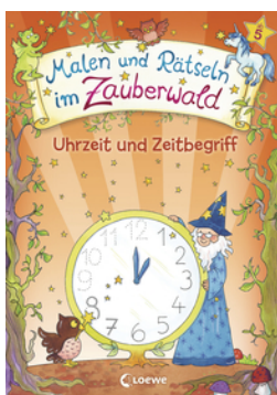
Drawing and Puzzle-solving in the Enchanted Forest - Time