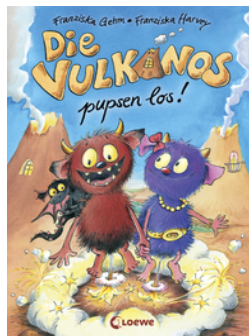
The Vulkanos Fart Away! (Vol. 1)