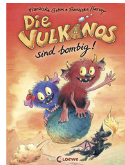
The Vulkanos Are Smashing! (Vol. 2)