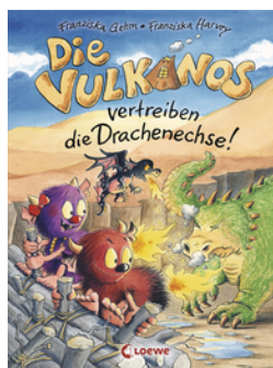
The Vulkanos Chase Away the Dragon Lizard! (Vol.8)