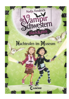
The Vampire Sisters black & pink - Night Owls in the Museum (Vol. 6)