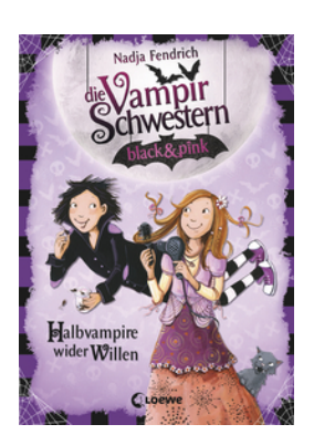
The Vampire Sisters black&pink - The Unwilling Half-Vampires (Vol. 1)