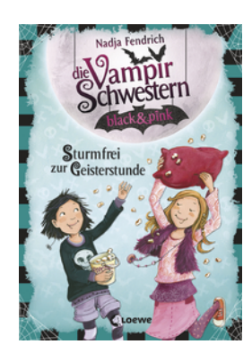
The Vampire Sisters black&pink - Home Alone During Witching Hour (Vol. 3)