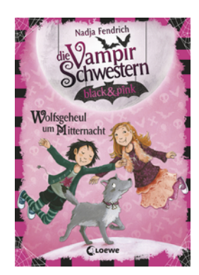
The Vampire Sisters black&pink - Howling of Wolves at Midnight (Vol. 4)