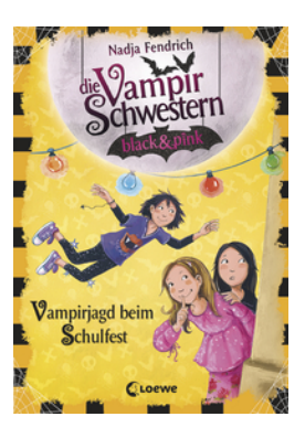
The Vampire Sisters black & pink - Vampire Hunt During School Celebrations (Vol.7)