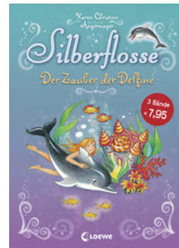
Silver Fin - The Magic of the Dolphins (Vol. 1-3)