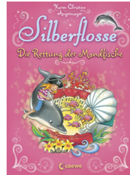
Silver Fin – Rescue of the Moon Fish (Vol. 3)