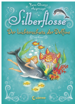
Silver Fin – The Dolphins' Treasure of Lights (Vol. 1)