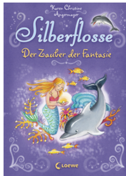
Silver Fin – Fantasy's Spell (Vol. 2)