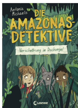
Amazon Detectives – Jungle Plot (Vol. 1)