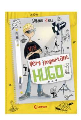
Very Important Hugo (Vol. 4)