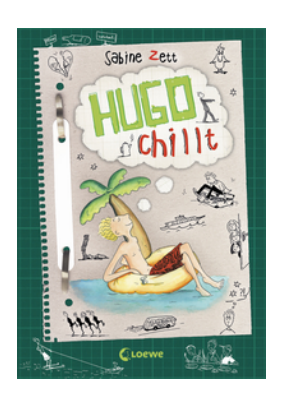
Hugo Chills (Vol. 5)