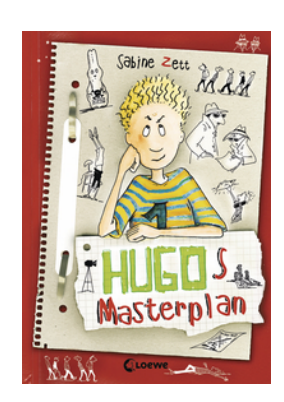
Hugo's Masterplan (Vol. 2)