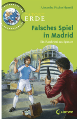
Global Mysteries – Foul Game in Madrid