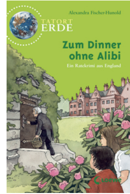
Global Mysteries – Dinner without an Alibi