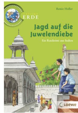
Global Mysteries – The Hunt for the Jewel Thieves