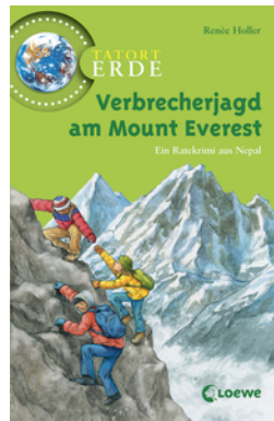
Global Mysteries – Hunting Criminals At the Foot of Mount Everest