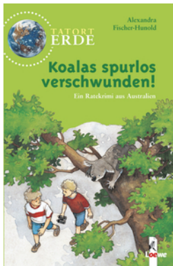
Global Mysteries – The Mystery of the Disappearing Koalas