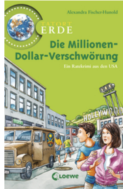
Global Mysteries – The Million Dollar Conspiracy