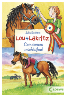
Lou and Liquorice - Two Stick Together (Bind-up Volume 3+4)