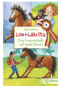
Lou and Liquorice - A Six- Legged Friendship (Bind-up volume 1+2)