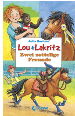
Two Shaggy Friends