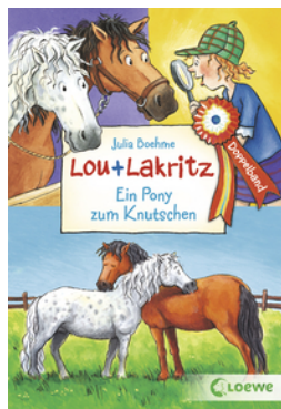
A Smoochy Pony (Lou + Liquorice)