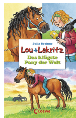
The Cleverest Pony in the World