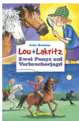
Two Ponies After a Thief