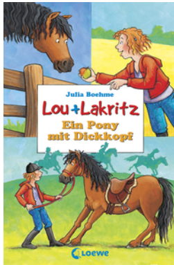
The Stubborn Pony