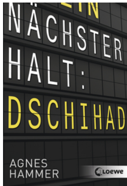
Next Stop: Jihad