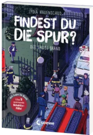
Can You Find the Clue? - The Great Fire Paperback