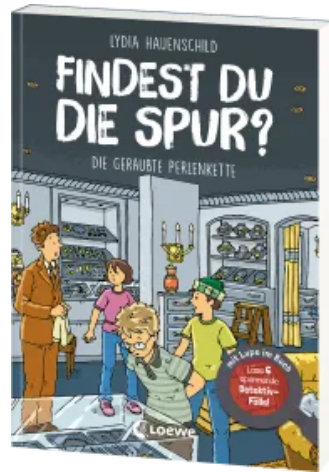
Can You Find the Clue? - The Stolen Pearl-Necklace Paperback