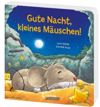
Good Night, Little Mouse! Hardcover