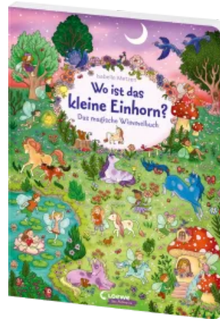
The Magical Hidden Object Book – Where is the Little Unicorn? Hardcover