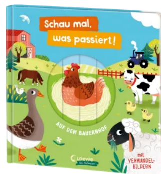
Schau mal, was passiert! Auf dem Bauernhof Hardcover