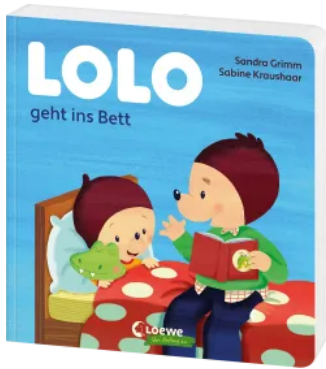
Lolo Goes to Bed Hardcover