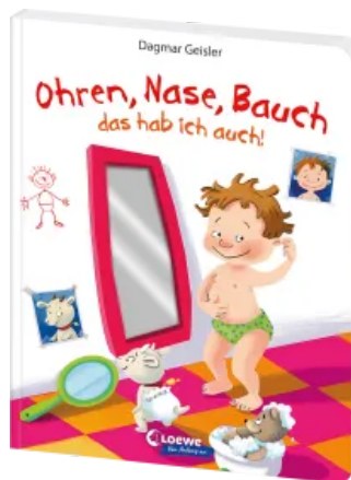
Ears, Nose, Belly - I Have Those too! Hardcover