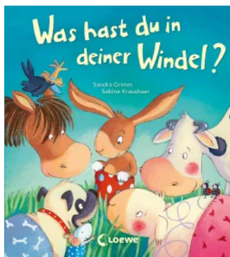
What Do You Have in Your Diaper? Hardcover