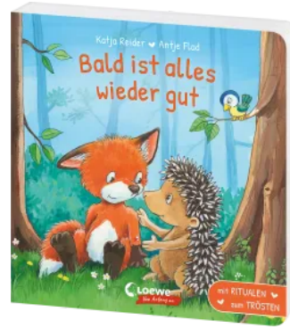
Everything Will Be Fine Again Soon Hardcover