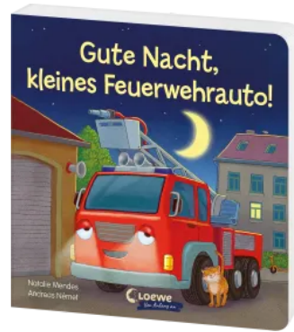
Good Night, Little Fire Truck! Hardcover