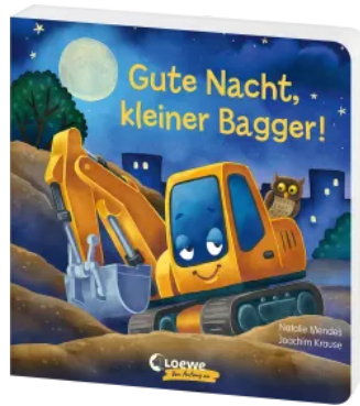
Good Night, Little Digger! Hardcover