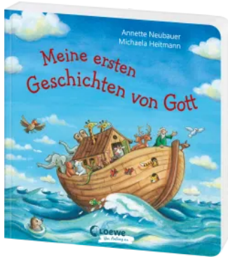
My First Stories of God Hardcover