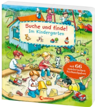
Search and Find! – In Kindergarten Hardcover