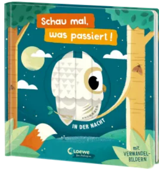
Schau mal, was passiert! In der Nacht Hardcover