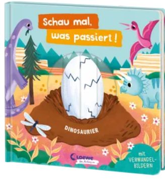
Schau mal, was passiert! Dinosaurier Hardcover