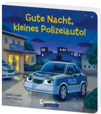
Good Night, Little Police Car! Hardcover