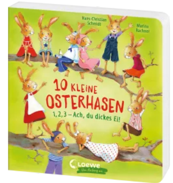
10 Little Easter Bunnies Hardcover