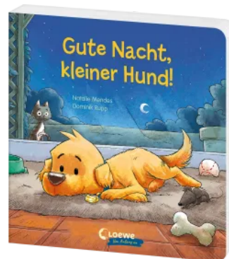
Good Night, Little Dog! Hardcover