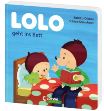
Lolo Goes to Bed Hardcover