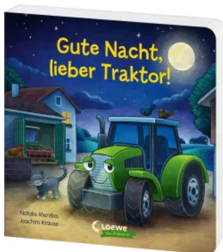
Good Night, Dear Tractor! Hardcover