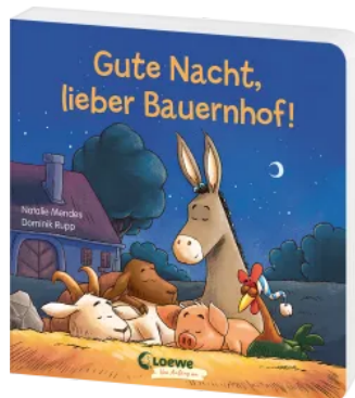
Good Night, Dear Farm! Hardcover