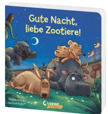
Good Night, Dear Zoo Animals! Hardcover