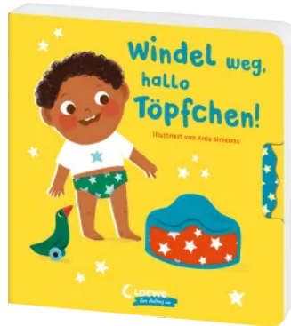
Windel weg, hallo Töpfchen! Hardcover