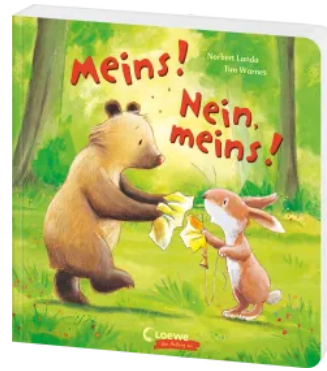
Meins! Nein, meins! Hardcover