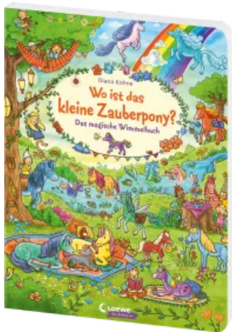
The Magical Hidden Object Book – Where Is the Little Magic Pony? Hardcover