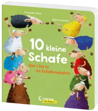
10 Little Sheep Hardcover