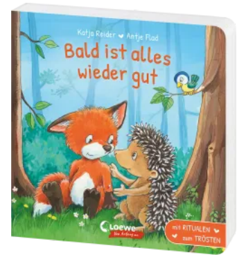
Everything Will Be Fine Again Soon Hardcover