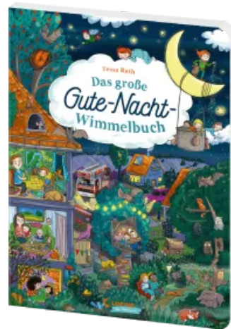
The Big Hidden Objects Book – Bedtime Hardcover