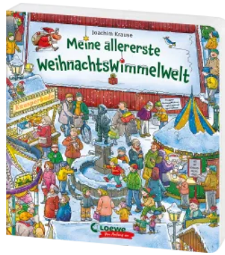
My First Hidden-Object Christmas World Hardcover