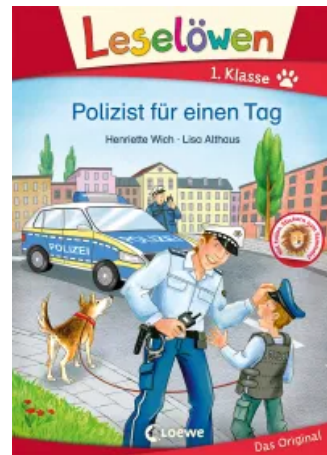
Policeman for a Day Hardcover