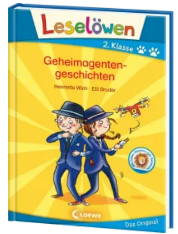
Secret Agents Stories Hardcover