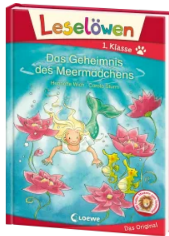
The Mermaid's Secret Hardcover