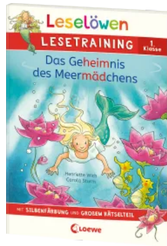
Leselöwen Reading Training Year 1 - The Mermaid's Secret Paperback