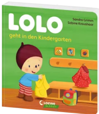
Lolo in Kindergarten Hardcover