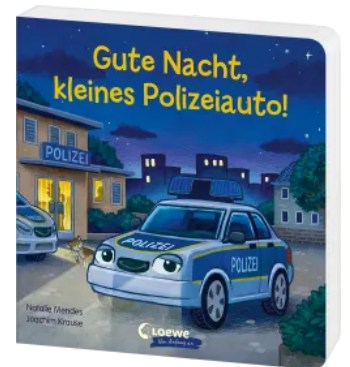
Good Night, Little Police Car! Hardcover