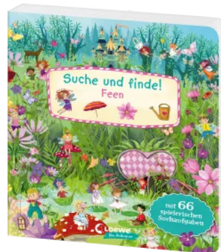
Search and Find! – Fairies Hardcover