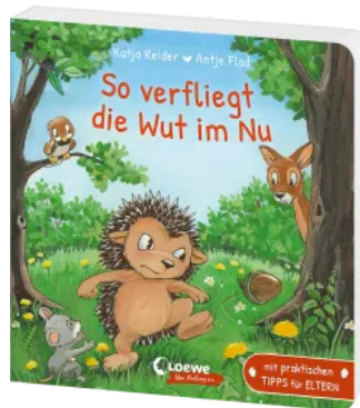
That's How Anger Flies Away in a Flash Hardcover