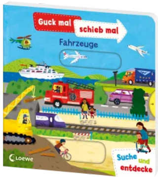
Guck mal, schieb mal! Suche und entdecke - Fahrzeuge Hardcover