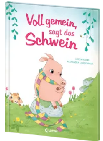
That's So Mean, Says the Piggy Hardcover