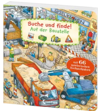
Search and Find! – Construction Site Hardcover