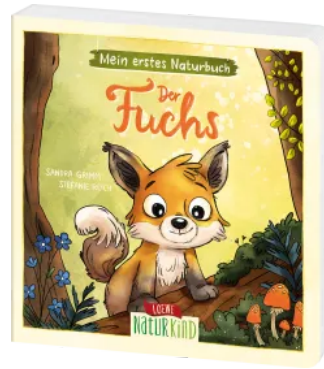
My First Naturebook – The Fox Hardcover