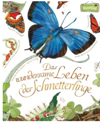
Das wundersame Leben der Schmetterlinge Hardcover