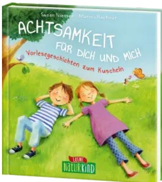
Attentiveness for All of Us! – Story Time is Cuddle Time! Hardcover