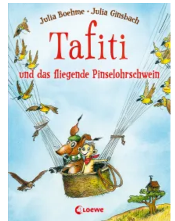
Tafiti and the Flying Red River Hog (Vol. 2)