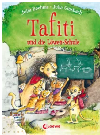
Tafiti and the School of Lions (Vol. 12)