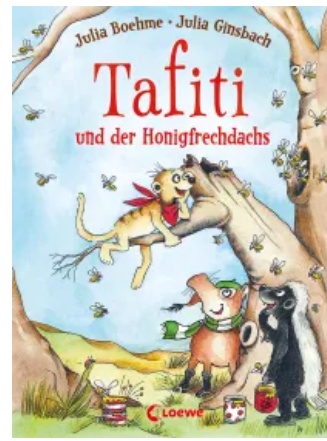
Tafiti and Pinsel on Mission Honey (Vol. 7)