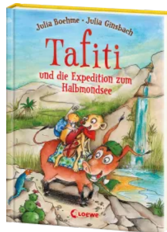
Tafiti and the Expedition to the Half-Moon Lake (Vol. 18)