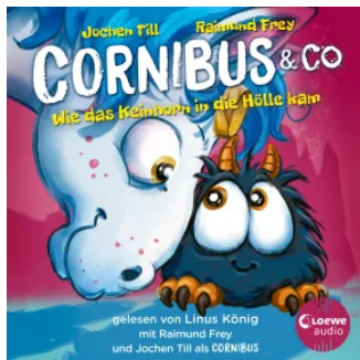
Cornibus & Co. - How the No-Unicorn Came to Hell (Vol. 4) Hardcover