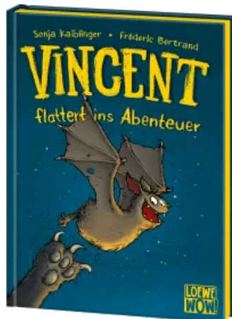
Vincent - Off to New Adventures (Vol.1) Hardcover