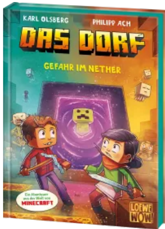
The Villagers (Vol. 2) Danger in Nether Hardcover