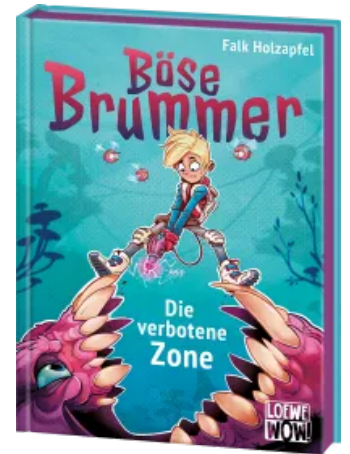
Bad Bugs - The Forbidden Zone (Vol.1) Hardcover