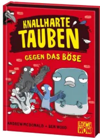
Knallharte Tauben gegen das Böse (Band 1) Hardcover