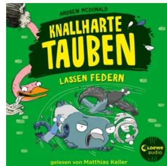
Knallharte Tauben lassen Federn (Band 2) Audio Book