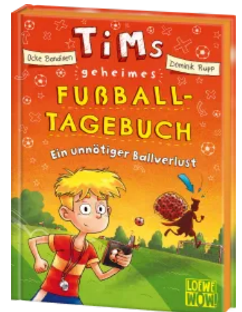
Tim's Secret Soccer Diary – Unncessary Ball Loss (Vol. 2) Hardcover