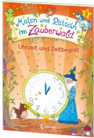
Drawing and Puzzle-solving in the Enchanted Forest - Time Paperback